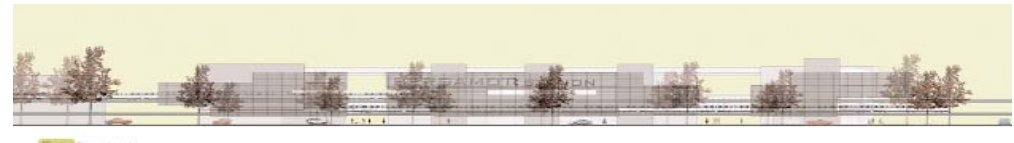
E 01 ▶ OLYMPIC BOULEVARD ELEVATION