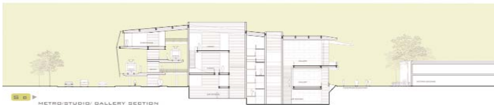
S 0 ▶ METRO/STUDIO/GALLERY SECTION