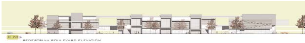
E 02 ▶ PEDESTRIAN BOULEVARD ELEVATION