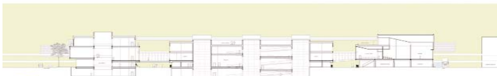
S 4 ▶ LONGITUDINAL SECTION