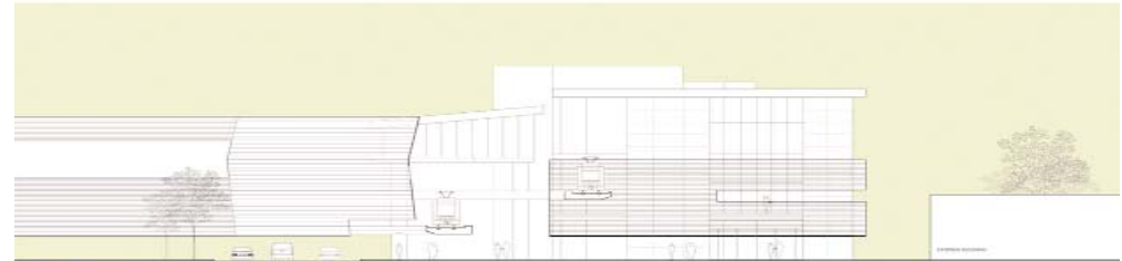
S 1 ▶ 26TH STREET SECTION