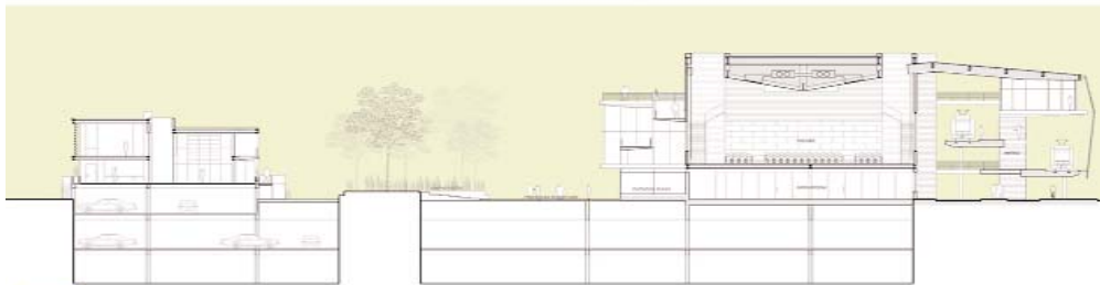
S 2 ▶ METRO/THEATER SECTION